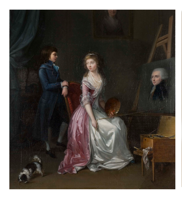
<u>Portrait of an Artist in Her Studio;</u> <u>Unidentified artist</u>